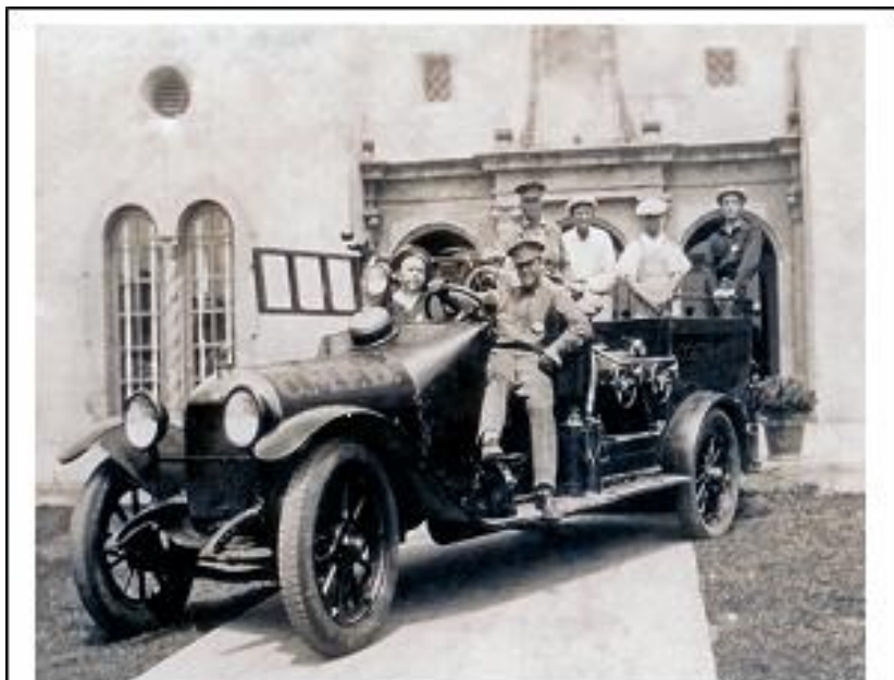
CMFD Chemical Wagon, April 1929