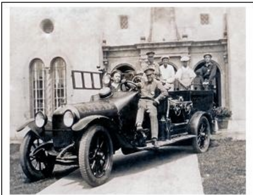
CMFD Chemical Wagon, April 1929