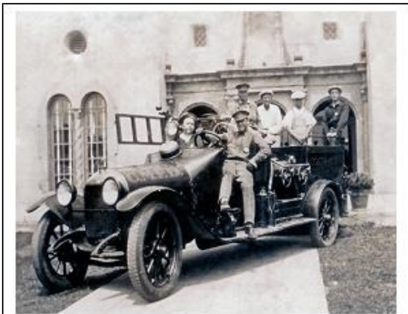
CMFD Chemical Wagon, April 1929